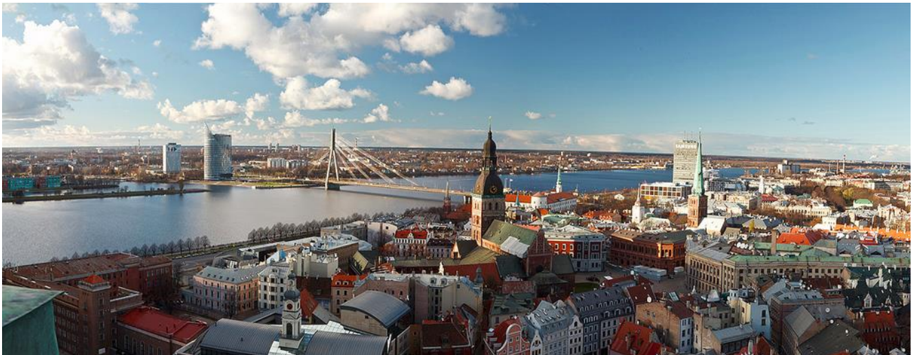
View from the Old City across the Daugava River from Old City.

The city presents a mix of cultures and architectural styles developed throughout different historical periods. The Daugava, also referred to as the River of Destiny by Latvians, flows through Riga into the Gulf of Riga about 10 kilometres from the city center. Because of its location and harbour, which rarely freezes, Riga has developed into a significant transportation hub. Riga has always been a dynamic and innovative center, and remains to this day a vibrant and lively city with a host of creative quarters to explore. It is therefore with good reason that Riga has been called the ‘city of inspiration’. Enjoy a leisurely walk around the Old Town – the historic center of Riga, which is a UNESCO World Heritage Site – and its surroundings. Riga has the population about 700 000.